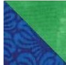
Blue & Green Fab