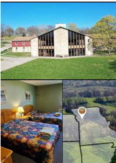
Lake Doniphan Conference and Retreat Center 12856 Doniphan Lake Rd Excelsior Springs, MO 64024 Visit lakedoniphan.com

Friday, October 29 - Sunday, October 31, 2021