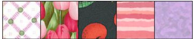
plaid, floral, BLACK, stripes, solid

5. Join 4 (2½") squares of assorted pink and/or purple prints into two pairs. Sew one of the pairs to one side of a black square (2½") , and the other pair to the opposite side of the black square. This is your final row.